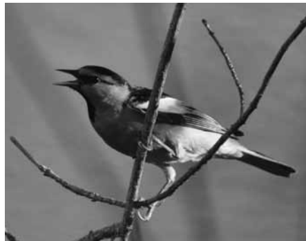
Bullock's Oriole

Please, send sightings for April Flicker Flashes at least five days before the March 1, deadline to Ann Miller, 520 Yorkshire Drive, Birmingham, Al. 35209 annmiller520@aol.com