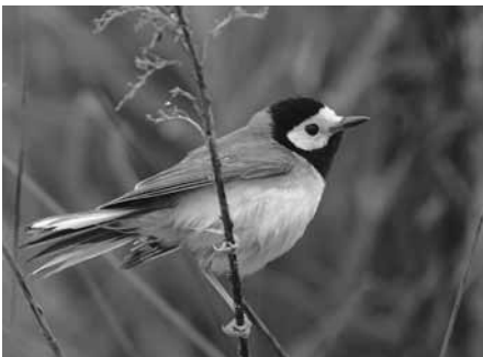
Hooded warbler