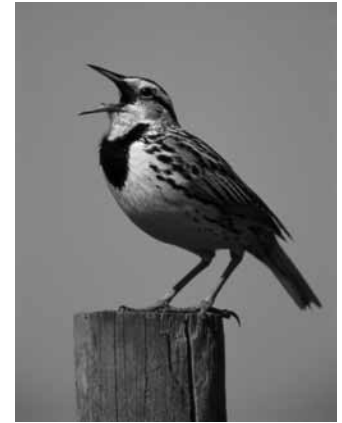
Eastern Meadowlark

WEBSITE: www.alabamabirdingtrails.com/sites/limestone-park/ www.alabamabirdingtrails.com/sites/ebenezer-swamp/