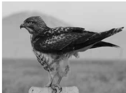
Rough Legged Hawk