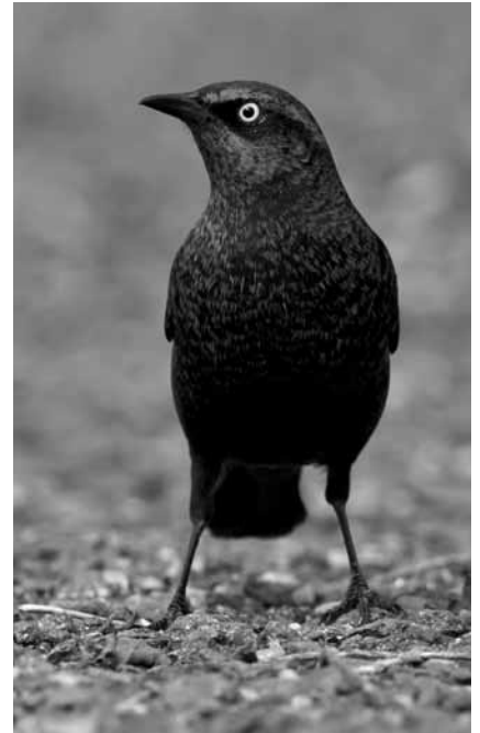
Rusty blackbird

Reporting your rusty blackbird sightings is easy using eBird. When entering your checklist, select the "Rusty Blackbird Blitz" observation type which will be available through the month of March. Please select this observation type instead of the typical "stationary" or "traveling" observation types for your checklists. For the non-eBird users, please note when and where you observed them (with any pertinent details) and send me your information.