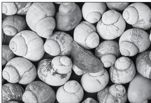
Snail shells

Aquatic systems in North America have the greatest gastropod diversity in the world, with 675 species in 14 families. In the United States, 516 gastropod species have been reported, and 313 are found in the Southeastern U.S. The Mobile River Basin is the epicenter of this diversity (118 species). The Cahaba River has the highest recorded diversity of extant pleu-