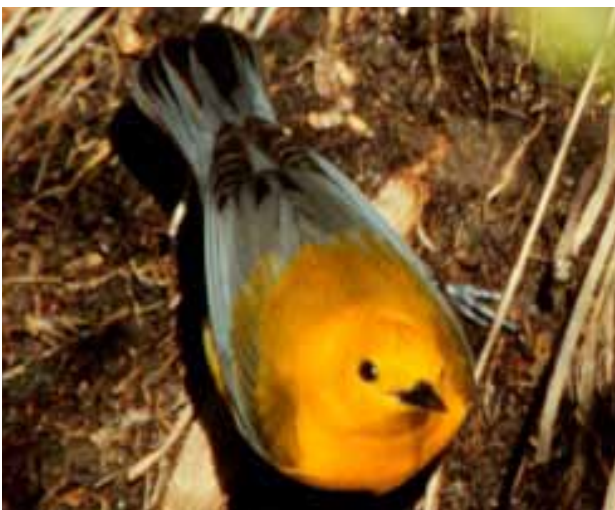
Swamp thing - Birmingham Audubon

Members of this month's species have only just recently arrived in Alabama, but will soon be building nests in tree cavities throughout our state's swampiest locales. Birders can look for that unmistakable color pattern: blue-green wings and tail leading into an olive back, then giving way into a brilliant, unbroken yellow on the head and breast—all of which makes the black bill and dark, beady eyes that much more striking. Need more? This neotropical migrant is one of two Alabama birds named after high officials in the Catholic church. Still can't figure it out? Google "Alger Hiss birding" and find out how this tiny species became associated with Cold War intrigue. . . Think you've got it? We'll have the answer for you in the fall!