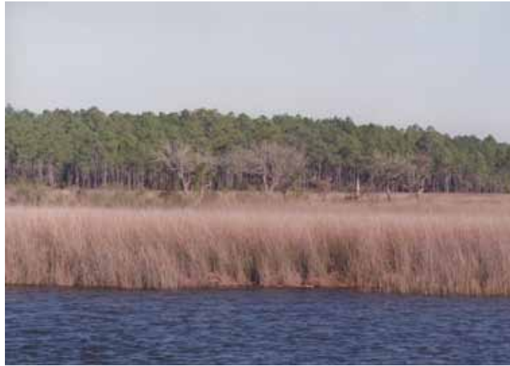
Grand Bay, AL - Live oak hammock in marsh and distant pine flatwoods