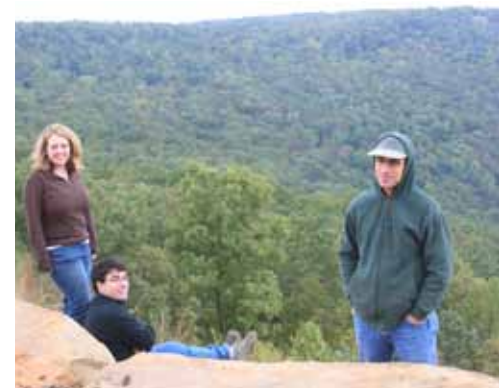
Huntsville, Monte Sano State Park

Trip leader: Greg Harber, 205-251-2133, home/evenings, or 205-807-8055, day of field trip only.