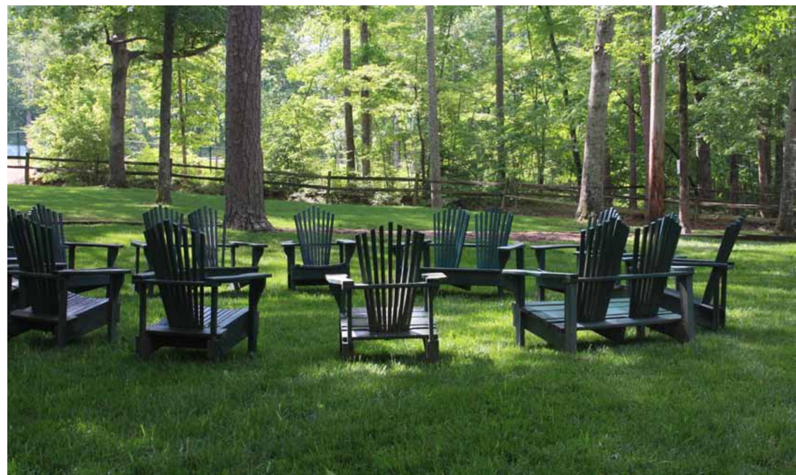
Birmingham Audubon Mountain Workshop celebrates its fortieth anniversary this May, 2017. Photo of past Birmingham Audubon Mountain Workshop courtesy Michelle Blackwood