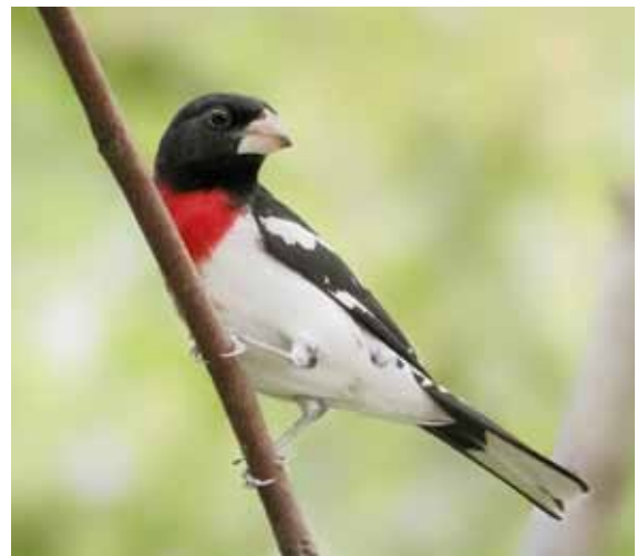
Rose-breasted Grosbeak

This all-day count will cover parts of Jefferson, Shelby, St. Clair and Blount counties, and we'll need as many participants as possible to adequately cover the area. Even though this is an all-day count, you may join a party for any part of the day if you only have a limited amount of time. It is essential though that you make arrangements now to join a party on count day. Feel free to call me at 251-2133 for the names and phone numbers of party leaders in your area. Or, you may wish to count the birds at your feeders and call or email your report to me later. Rose-breasted Grosbeaks will surely reward those who take the time to watch at home!