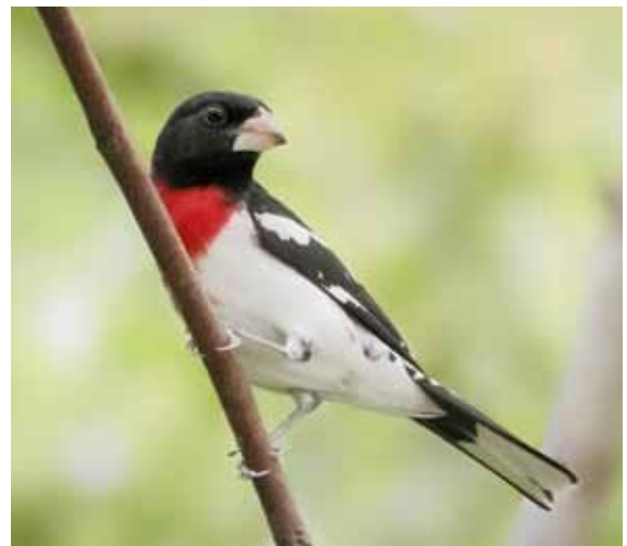
Rose-breasted Grosbeak

This all-day count will cover parts of Jefferson, Shelby, St. Clair and Blount counties, and we'll need as many participants as possible to adequately cover the area. Even though this is an all-day count, you may join a party for any part of the day if you only have a limited amount of time. It is essential though that you make arrangements now to join a party on count day. Feel free to call me at 251-2133 for the names and phone numbers of party leaders in your area. Or, you may wish to count the birds at your feeders and call or email your report to me later. Rose-breasted Grosbeaks will surely reward those who take the time to watch at home!